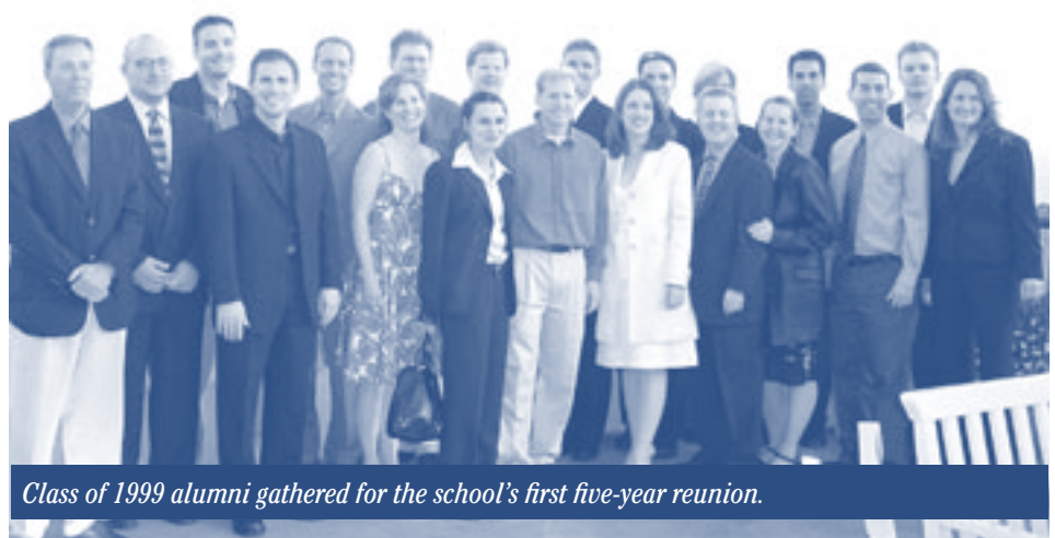
Class of 1999 alumni gathered for the school's first five-year reunion.